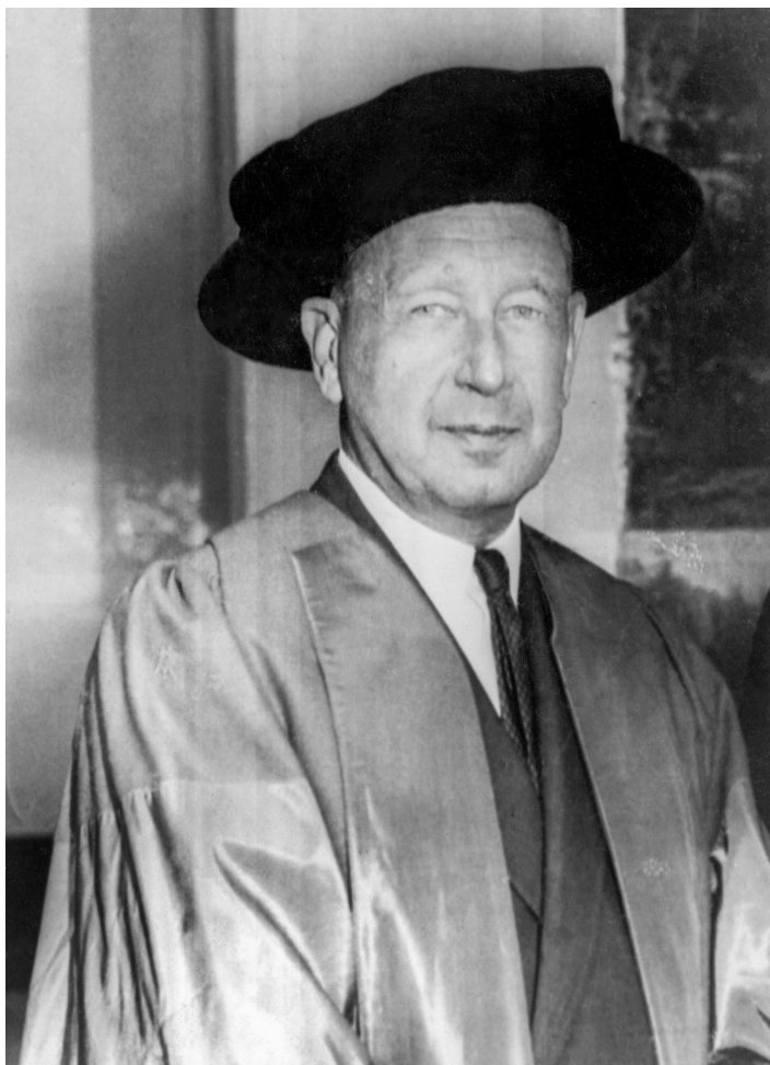
Above: Dag Hammarskjöld after receiving his honorary doctorate of Civil Law from the University of Oxford on 30 May 1961.